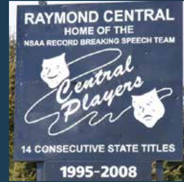
Speech, Drama, Fine Arts