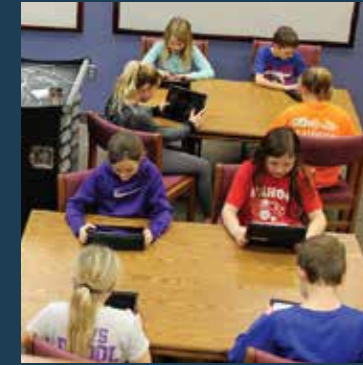
Technology, Safe Learning