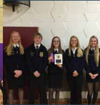
Student Organizations, Athletics