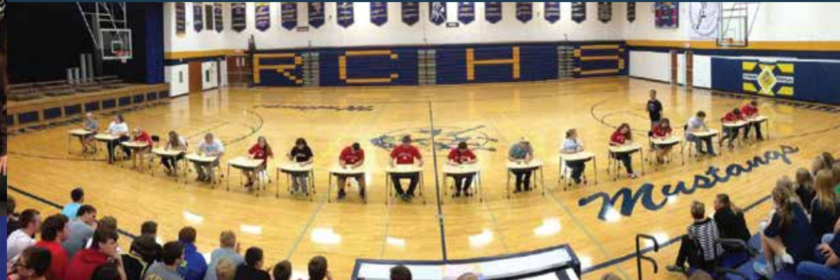
Academic College Signing Day